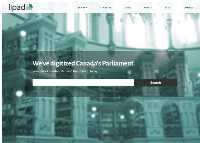
FIGURE 3 Lipad.ca Home Page